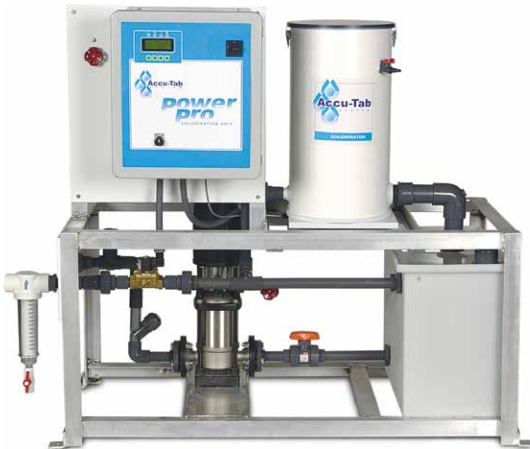
Accu-Tab system PowerPro 3075 chlorination unit shown with automated controller and weigh scale options.

PowerPro units are available in both gravity and pressure return models. They feature a simple "hook-up/plug-in" installation that expedites conversion from your old system. PowerPro units can be easily customized to meet your individual requirements and the compact size makes installation easy.