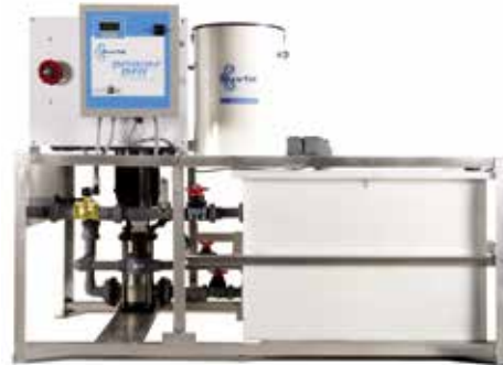
PowerPro MD chlorination unit using Accu-Tab chlorinator model 3150 as shown.