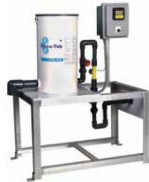
PowerPro Gravity chlorination unit using Accu-Tab chlorinator model 3075 with digital flow meter as shown.